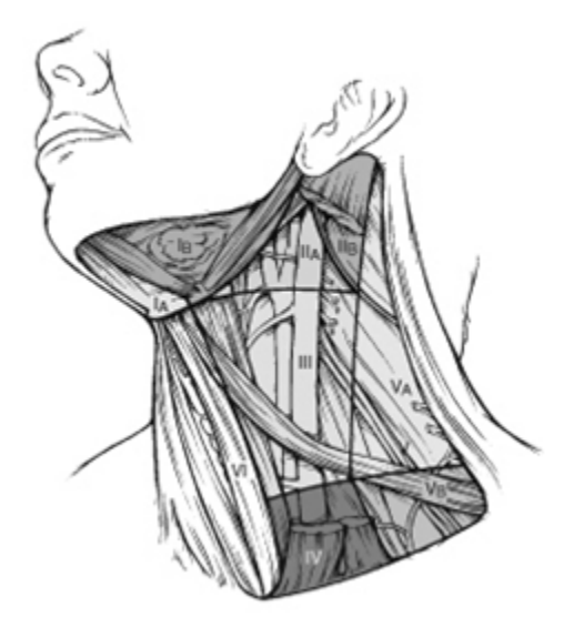
Figure 2. The six sublevels of the neck for describing the location of lymph nodes within levels I, II, and V. Level IA, submental group; level IB, submandibular group; level IIA, upper jugular nodes along the carotid sheath, including the subdigastric group; level IIB, upper jugular nodes in the submuscular recess; level VA, spinal accessory nodes; and level VB, the supraclavicular and transverse cervical nodes. From: Flint PW, et al, eds. Cummings Otolaryngology: Head and Neck Surgery. 5th ed. Philadelphia, PA; Saunders: 2010. Reproduced with permission © Elsevier.

In order for pathologists to properly identify these nodes, they must be familiar with the terminology of the regional lymph node groups and with the relationships of those groups to the regional anatomy. Which lymph node groups surgeons submit for histopathologic evaluation depends on the type of neck dissection they perform. Therefore, surgeons must supply information on the types of neck dissections that they