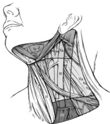
Figure 2. The six sublevels of the neck for describing the location of lymph nodes within levels I, II, and V. Level IA, submental group; level IB, submandibular group; level IIA, upper jugular nodes along the carotid sheath, including the subdigastric group; level IIB, upper jugular nodes in the submuscular recess; level VA, spinal accessory nodes; and level VB, the supraclavicular and transverse cervical nodes. From: Flint PW, et al, eds. Cummings Otolaryngology: Head and Neck Surgery . 5th ed. Philadelphia, PA; Saunders: 2010.

In order for pathologists to properly identify these nodes, they must be familiar with the terminology of the regional lymph node groups and with the relationships of those groups to the regional anatomy. Which lymph node groups surgeons submit for histopathologic evaluation depends on the type of neck dissection they perform. Therefore, surgeons must supply information on the types of neck dissections