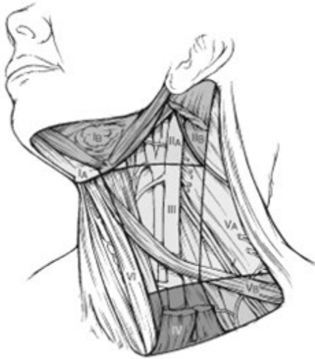
Figure 2. The six sublevels of the neck for describing the location of lymph nodes within levels I, II, and V. Level IA, submental group; level IB, submandibular group; level IIA, upper jugular nodes along the carotid sheath, including the subdigastric group; level IIB, upper jugular nodes in the submuscular recess; level VA, spinal accessory nodes; and level VB, the supraclavicular and transverse cervical nodes.

In order for pathologists to properly identify these nodes, they must be familiar with the terminology of the regional lymph node groups and with the relationships of those groups to the regional anatomy. Which lymph node groups surgeons submit for histopathologic evaluation depends on the type of neck dissection they perform. Therefore, surgeons must supply information on the types of neck dissections that they perform and the details of the local anatomy in the specimens they submit for examination or, in other manners, orient those specimens for pathologists.