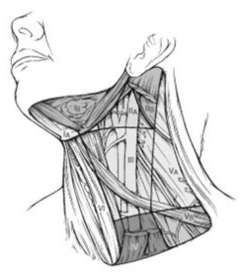
Figure 2. The six sublevels of the neck for describing the location of lymph nodes within levels I, II, and V. Level IA, submental group; level IB, submandibular group; level IIA, upper jugular nodes along the carotid sheath, including the subdigastric group; level IIB, upper jugular nodes in the submuscular recess; level VA, spinal accessory nodes; and level VB, the supraclavicular and transverse cervical nodes. From: Flint PW, et al, eds. Cummings Otolaryngology: Head and Neck Surgery. 5th ed. Philadelphia, PA; Saunders: 2010. Reproduced with permission © Elsevier.

In order for pathologists to properly identify these nodes, they must be familiar with the terminology of the regional lymph node groups and with the relationships of those groups to the regional anatomy. Which